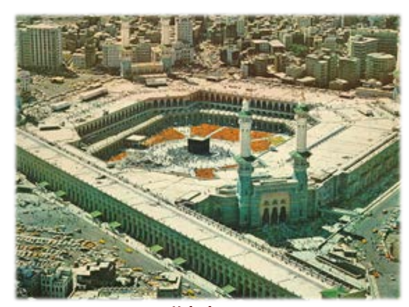
Masjid al Haram

During the Ḥajj, there are a few other places besides the Holy Mosque that pilgrims must visit, as we learnt above.