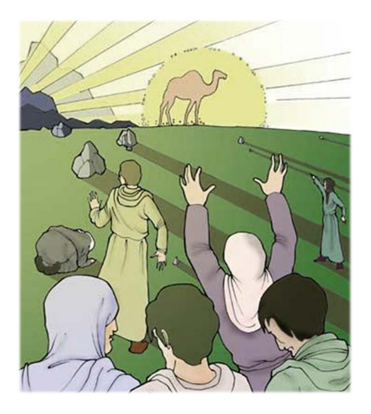
Prophet Ṣaleḥ (as) then said to the people:

At this point, Allah (SWT) gave permission to Prophet Ṣaleḥ (as) to perform a miracle. The people gathered to witness this miracle. To their amazement, a young camel suddenly appeared through a mountain.