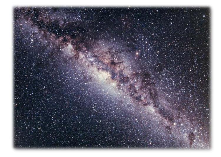
Figure 2: The unquestionable beauty of our galaxy, the Milkyway

When looked at broadly, the universe is huge, containing millions of creatures, each moving towards its own perfection. The universe as a whole is also moving towards its perfection. If we ever had the ability to see this reality, we would see nothing but beauty. However, sometimes as different creatures move towards their perfection, their journeys collide, and this collision leads to something that seems evil or detestable. Looking at it from our viewpoint, we only see an unsightly collision, but looking at it from above we see an encompassing beauty as both the whole and each part moves towards its beautiful perfection.