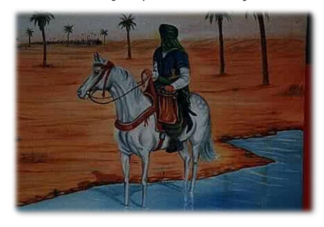
Figure 5 An illustrative depiction of Imam Hussein in Karbala

"My Lord, You are my witness that I have fulfilled my mission in life without hesitation, without shying away, without faltering, without complaining. My Lord, and the Lord of the universe, I submit unreservedly to Your decree and resign myself to Your dispensation"