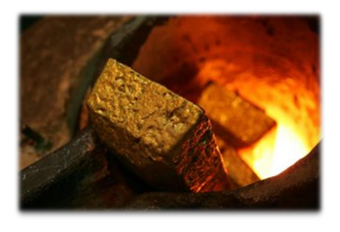
Figure 3: Just like gold is purified by fire, we are purified by difficulties and things that seem evil

These things that seem evil to us are often tests so that we may better ourselves.