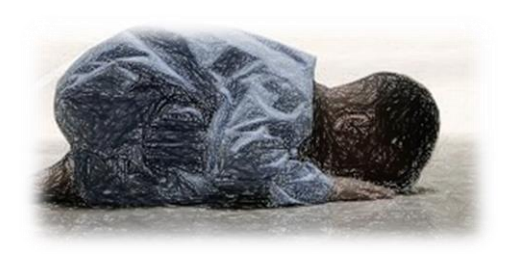
One of the best ways to thank Allah is through Sujoūd