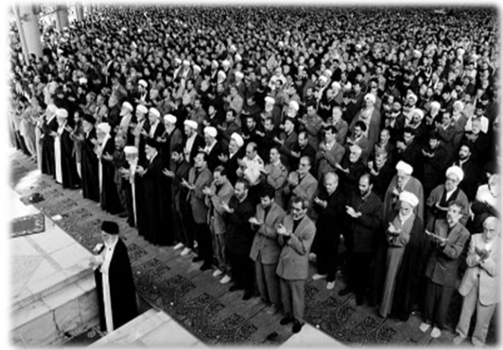
Figure 2. Praying is WĀJIB; Praying in Jamā'ah is MUSTAḤAB

MUSTAḤAB: something that is recommended to do, for example reciting the adhān before prayers. We do not have to perform Mustaḥab acts and we will not be punished for not doing them. However, there will be extra rewards and benefit for us if we do them. They also help to bring us closer to Allah (SWT) and improve our spirituality.