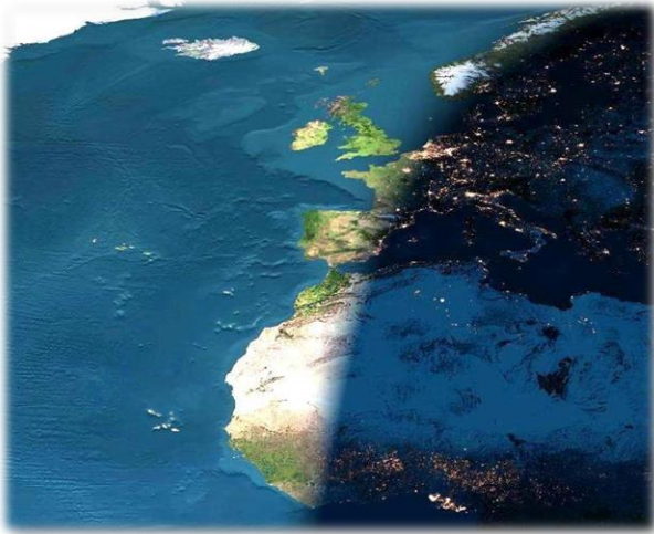
Figure 2: Night enveloping day

The examples are numerous and are beyond the scope of this lesson. The possibility of such perfect order and intelligent law coming about by chance is so minuscule that a rational being would dismiss it. The chances of an ape accidentally typing a Shakespearian masterpiece when put in front of a typewriter would be greater than this universe, with all the order witnessed therein, being created by chance. A rational being accepts that such perfect order is only possible if the one who has put it in place is Wise and Intelligent Being. This Wise and Intelligent Creator is God.