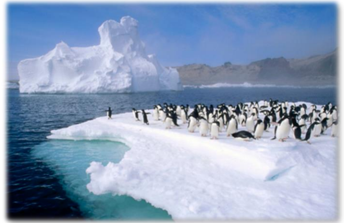
Figure 3: Every element of an ecosystem whether large or small, alive or inanimate, fulfils its God-given potential to ensure balance and order are preserved